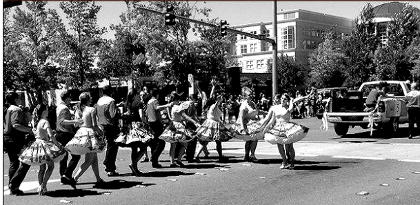
Photo left: Jacks & Jills participating in the Kent Cornucopia Festival Parade on July 14th. Photo above: Jacks & Jills club families at the Memorial Weekend Camp Out.

Festival and Parade. The Jacks & Jills danced at the main stage two nights in a row, inviting people to learn how to square dance and have the time of their life for FREE! All the families got their tents, sunscreen, bathing suits, and camping gear organized to go on monthly camping trips together. Everyone had a great time enjoying each other's company and making great memories!